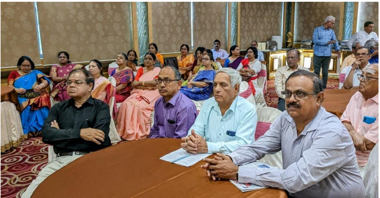
A view of the gathering